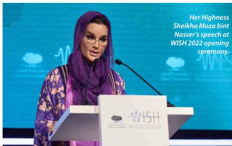
Her Highness Sheikha Moza bint Nasser's speech at WISH 2022 opening ceremony.

In his remarks at the opening ceremony, British-American surgeon, academic and politician, Prof. Lord Ara Darzi of Denham, executive chair