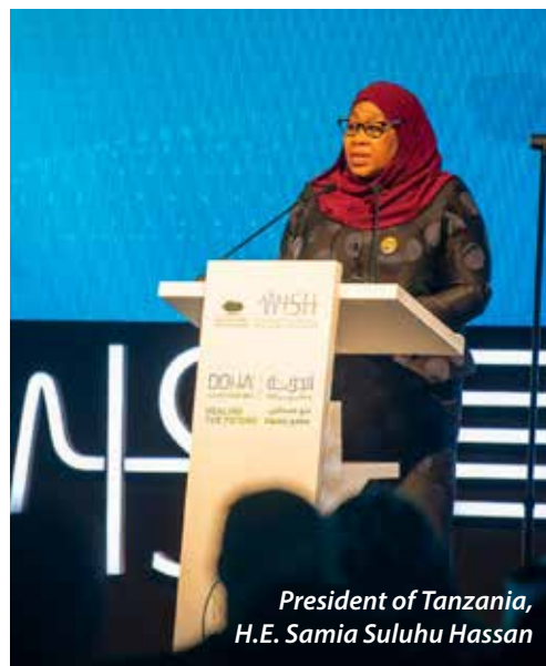
President of Tanzania, H.E. Samia Suluhu Hassan