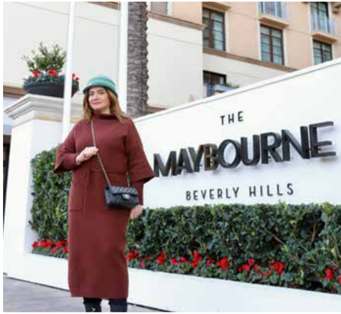
By Nourah Khan Travel Writer The Times Kuwait

When I think of an unforgettable hotel stay—where luxury meets impeccable service—The Maybourne Beverly Hills is the first name that comes to mind. This hotel is not just a place to stay, it is a destination in itself, where exceptional design, personalized service, and an atmosphere of refined luxury create a truly unique experience.