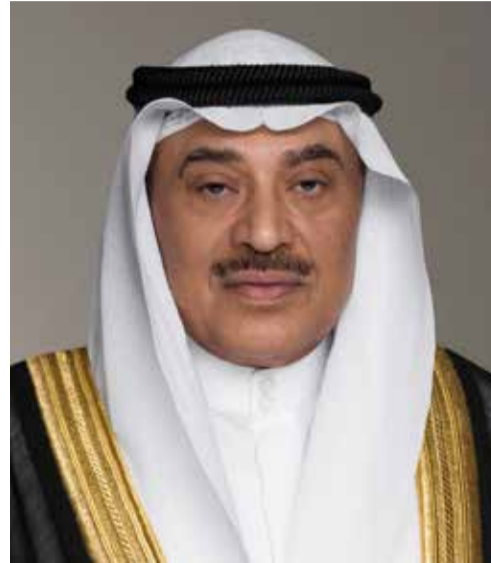
received phone calls from the leaders of the United Republic of Comoros, the Republic of Senegal, and the State of Palestine. The leaders

strongly condemned Iran's recent attacks on Kuwaiti territory, describing them as blatant violations of sovereignty and international law.