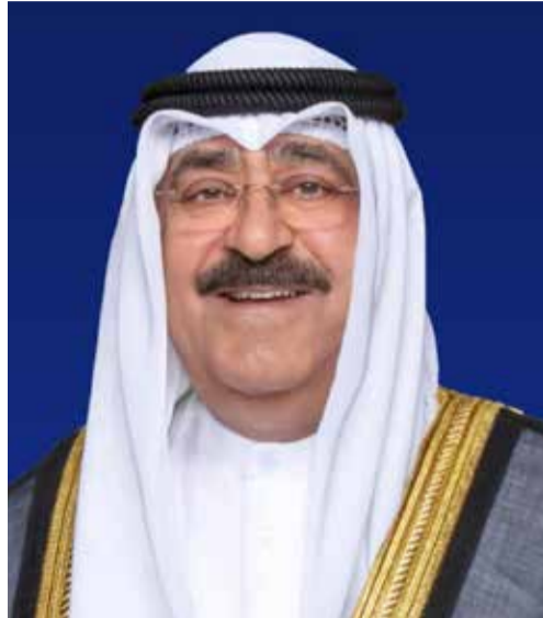
Messages of support and solidarity were also sent to His Highness the Crown Prince Sheikh Sabah Al-Khaled Al-Hamad Al-Sabah, who

Algerian President Abdelmadjid Tebboune also condemned the attack and expressed Algeria's full support for Kuwait. His Highness the Amir expressed appreciation for the leaders' solidarity and good wishes