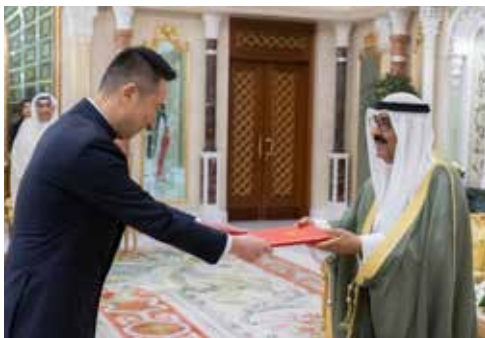
H.E. Yang Xin of the People's Republic of China