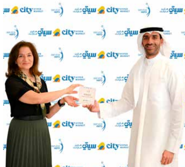
Alongside this achievement, City Hypermarket continues to expand its presence across Kuwait, having recently opened new

This recognition reflects sustained trust from customers across Kuwait. As Service Hero's rankings are based entirely on validated consumer assessments, the award highlights City Hypermarket's consistent ability to meet customer expectations across service quality, product offering, and overall shopping experience.