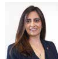
Claudia Sanhueza is a former deputy finance minister and former undersecretary of international economic relations of Chile.

When this period of Trumpian disorder eventually gives way to reconstruction, the Global South must come to the table with proposals, not just complaints. The order that is now fracturing was built largely without us, but that need not be true of the next one. Countries that cannot impose their preferences by force must continue to do the unglamorous work of coordination and collaboration—much like we did in India last year. Only by coming together now can we create a global system where the rules apply to all.